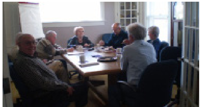
A Socrates Cafe Meeting in 2009